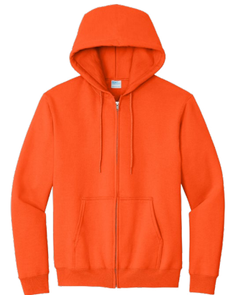
PORT & COMPANY® Essential Fleece Full-Zip Hooded Sweatshirts PC90ZH | PC90ZHT | Adult Sizes: S-4XL | Tall Sizes: LT-4XLT