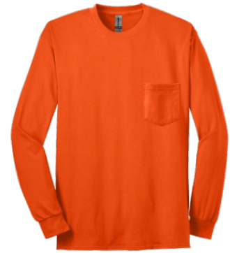
GILDAN® Ultra Cotton® 100% US Cotton Long Sleeve T-Shirt with Pocket 2410 | Adult Sizes: S-4XL