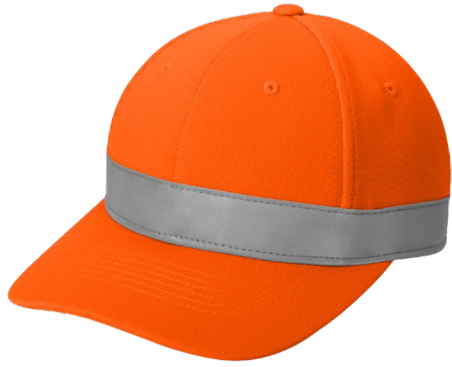
CORNERSTONE® ANSI 107 Safety Cap CS802