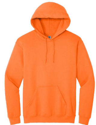
GILDAN® Heavy Blend™ Hooded Sweatshirt 18500 | Adult Sizes: S-5XL