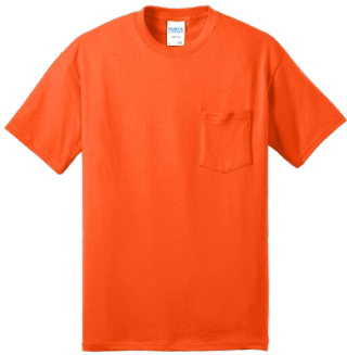
PORT & COMPANY® Core Blend Pocket Tees PC55P | PC55PT | Adult Sizes: S-6XL | Tall Sizes LT-4XLT