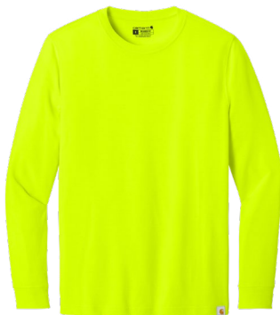
CARHARTT FORCE® Long Sleeve T-Shirt CT106921 | Adult Sizes: S-4XL