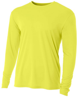
A4 Cooling Performance Long Sleeve Tee A4N3165 | Adult Sizes: XS-4XL