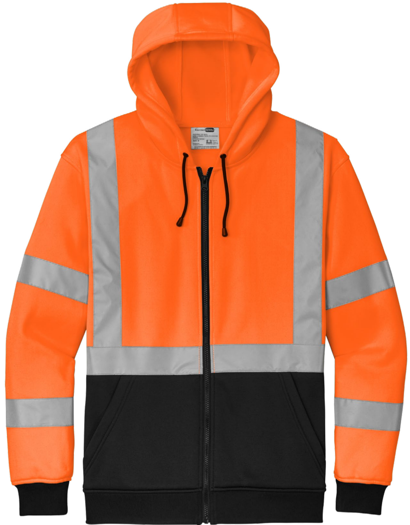
CORNERSTONE® ANSI 107 Class 3 Heavy-Duty Fleece Full-Zip Hoodie CSF300 | Adult Sizes: M-5XL