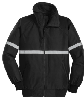
PORT AUTHORITY® Challenger™ Jacket with Reflective Taping J754R | Adult Sizes: XS-6XL