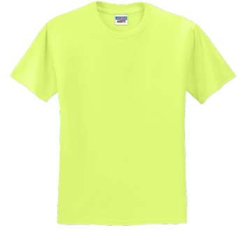
JERZEES® Dri-Power® 50/50 Cotton/ Poly T-Shirts 29M | 29B | Adult Sizes: S-5XL | Youth Sizes: XS-XL