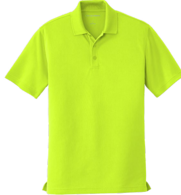
PORT AUTHORITY® Dry Zone® UV Micro-Mesh Polo KT110 | Adult Sizes: XS-6XL