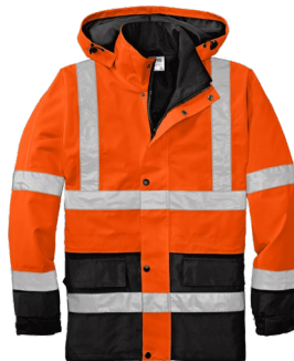
CORNERSTONE® ANSI 107 Class 3 Waterproof Parka CSJ24 | Adult Sizes: S-4XL