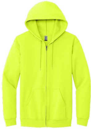
GILDAN® Heavy Blend™ Full-Zip Hooded Sweatshirt 18600 | Adult Sizes: S-5XL