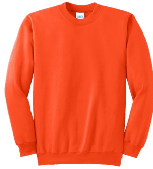
PORT & COMPANY® Essential Fleece Crewneck Sweatshirts PC90 | PC90T | Adult Sizes: S-4XL | Tall Sizes: LT-4XLT