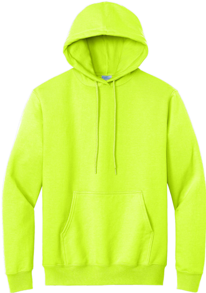
PORT & COMPANY® Essential Fleece Pullover Hooded Sweatshirts PC90H | PC90HT | Adult Sizes: S-4XL | Tall Sizes: LT-4XLT