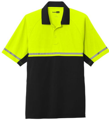
CORNERSTONE® Select Lightweight Snag-Proof Enhanced Visibility Polo CS423 | Adult Sizes: XS-4XL