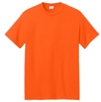
PORT & COMPANY® Core Blend Recycled Tee PC01 | Adult Sizes: S-4XL