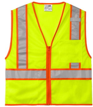
CORNERSTONE® ANSI 107 Class 2 Mesh Zippered Two-Tone Vest CSV103 | Adult Sizes: S/M, L/XL, 2XL/3XL, 4XL/5XL