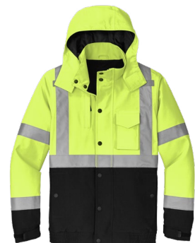
CORNERSTONE® ANSI 107 Class 3 Waterproof Insulated Ripstop Bomber Jacket CSJ501 | Adult Sizes: S-5XL