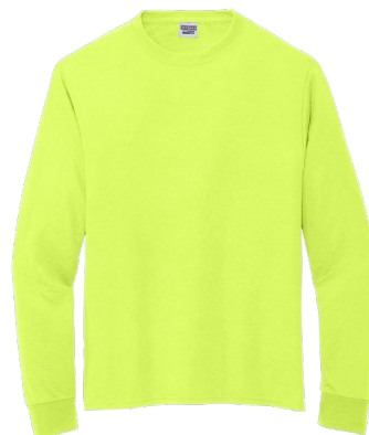
JERZEES® Dri-Power® 100% Polyester Long Sleeve T-Shirt 21LS | Adult Sizes: S-3XL