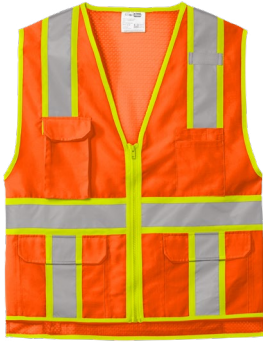
CORNERSTONE® ANSI 107 Class 2 Surveyor Zippered Two-Tone Vest CSV105 | Adult Sizes: S/M, L/XL, 2XL/3XL, 4XL/5XL