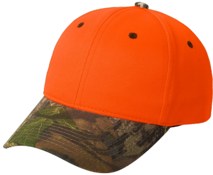
PORT AUTHORITY® Enhanced Visibility Cap with Camo Brim C804