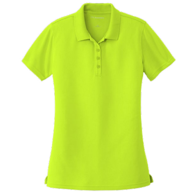
PORT AUTHORITY® Women's Dry Zone® UV Micro-Mesh Polo LK110 | Adult Sizes: XS-4XL