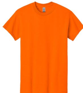
GILDAN® Heavy Cotton™ 100% Cotton T-Shirts 5000 | 5000B | Adult Sizes: S-3XL | Youth Sizes: XS-5XL