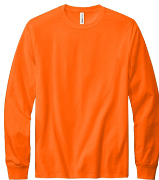
VOLUNTEER KNITWEAR™ All-American Long Sleeve Tee VL100LS | Adult Sizes: S-4XL