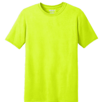
GILDAN® Performance® T-Shirt 42000 | Adult Sizes: S-3XL