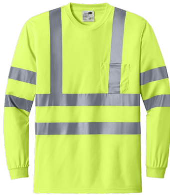
CORNERSTONE® ANSI 107 Class 3 Long Sleeve Snag-Resistant Reflective T-Shirt CS409 | Adult Sizes: XS-4XL