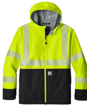
CARHARTT® ANSI 107 Class 3 Storm Defender® Jacket CT106693 | Adult Sizes: S-4XL