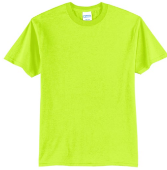
PORT & COMPANY® Core Blend Tees PC55 | PC55T | PC55Y | Adult Sizes: S-6XL | Tall Sizes: LT-4XLT | Youth Sizes: XS-XL