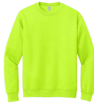
JERZEES® Super Sweats® NuBlend® Crewneck Sweatshirt 4662M | Adult Sizes: S-3XL