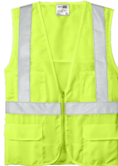
CORNERSTONE® ANSI 107 Class 2 Mesh Back Safety Vest CSV405 | Adult Sizes: S-4XL