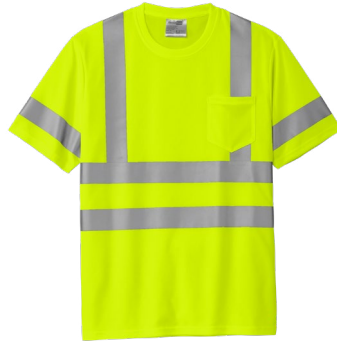
CORNERSTONE® ANSI 107 Class 3 Mesh Tee CS202 | Adult Sizes: M-5XL