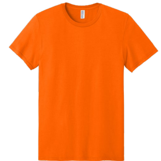
JERZEES CLASSICS™ Unisex Cotton T-Shirts 363M | 363Y | Adult Sizes: S-5XL | Youth Sizes: XS-XL