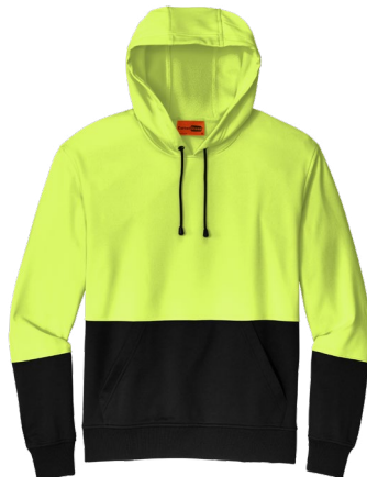
CORNERSTONE® Enhanced Visibility Fleece Pullover Hoodie CSF01 | Adult Sizes: XS-4XL