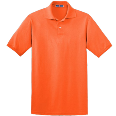
JERZEES® Dri-Power® Sport Shirt 437M | Adult Sizes: S-4XL