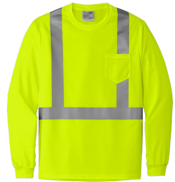
CORNERSTONE® ANSI 107 Class 2 Mesh Long Sleeve Tee CS201 | Adult Sizes: S-5XL