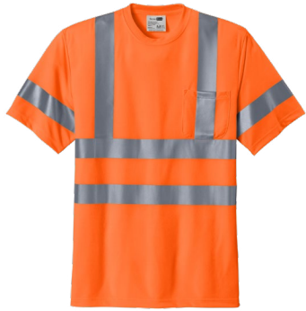
CORNERSTONE® ANSI 107 Class 3 Short Sleeve Snag-Resistant Reflective T-Shirt CS408 | Adult Sizes: XS-4XL