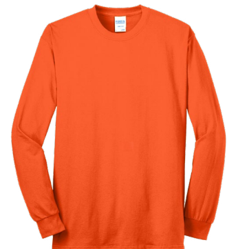
PORT & COMPANY® Long Sleeve Core Blend Tees PC55LS | PC55LST | Adult Sizes: S-6XL | Tall Sizes: LT-4XLT