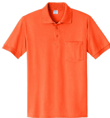
PORT & COMPANY® Core Blend Jersey Knit Pocket Polo KP55P | Adult Sizes: S-6XL