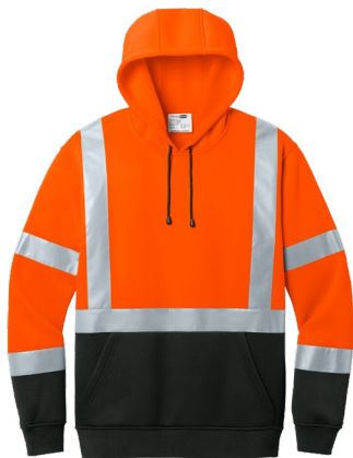
CORNERSTONE® ANSI 107 Class 3 Heavy-Duty Fleece Pullover Hoodie CSF301 | Adult Sizes: M-5XL