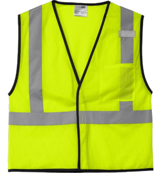
CORNERSTONE® ANSI 107 Class 2 Economy Mesh One-Pocket Vest CSV100 | Adult Sizes: S/M, L/XL, 2XL/3XL, 4XL/5XL