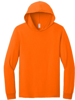
JERZEES CLASSICS™ Unisex Cotton Long Sleeve Hooded T-Shirt 363LH | Adult Sizes: S-3XL