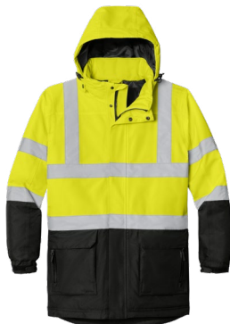
PORT AUTHORITY® ANSI 107 Class 3 Safety Heavyweight Parka J799S | Adult Sizes: XS-4XL