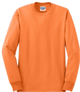
JERZEES® Dri-Power® 50/50 Cotton/Poly Long Sleeve T-Shirt 29LS | Adult Sizes: S-3XL