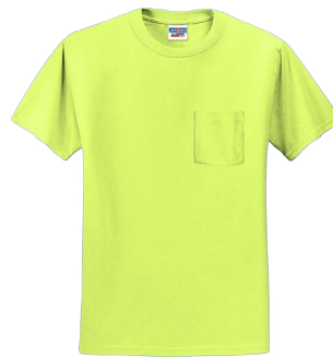
JERZEES® Dri-Power® 50/50 Cotton/Poly Pocket T-Shirt 29MP | Adult Sizes: S-3XL