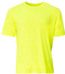
A4 Softtek Short Sleeve Tee A4N3013 | Adult Sizes: XS-4XL