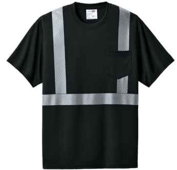
CORNERSTONE® Enhanced Visibility Segmented Tape Tee CS206 | Adult Sizes: S-5XL