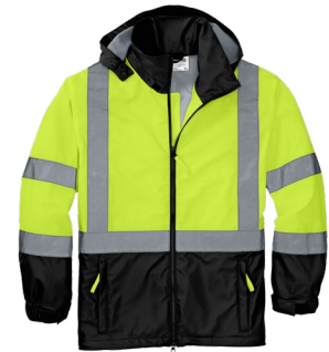
CORNERSTONE® ANSI 107 Class 3 Safety Windbreaker CSJ25 | Adult Sizes: S-4XL