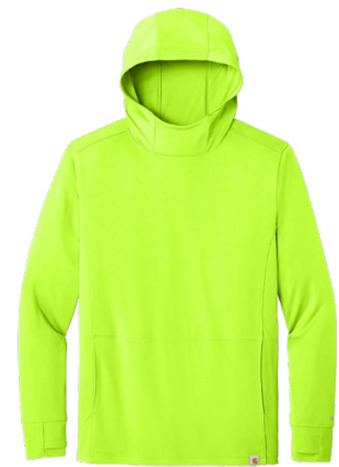
CARHARTT FORCE® Sun Defender™ Long Sleeve Hooded T-Shirt CT106923 | Adult Sizes: S-4XL