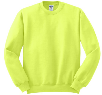
JERZEES® NuBlend® Crewneck Sweatshirt 562M | Adult Sizes: S-4XL