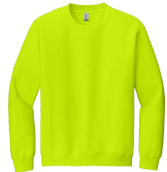
GILDAN® Heavy Blend™ Crewneck Sweatshirt 18000 | Adult Sizes: S-5XL