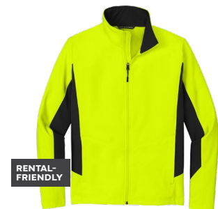
PORT AUTHORITY® Core Colorblock Soft Shell Jacket J318 | Adult Sizes: XS-4XL