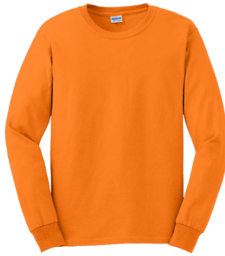
GILDAN® Ultra Cotton® 100% US Cotton Long Sleeve T-Shirt G2400 | Adult Sizes: S-4XL