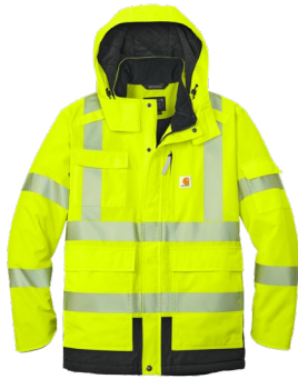
CARHARTT® ANSI 107 Class 3 Waterproof Heavyweight Insulated Jacket CT106694 | Adult Sizes: S-4XL