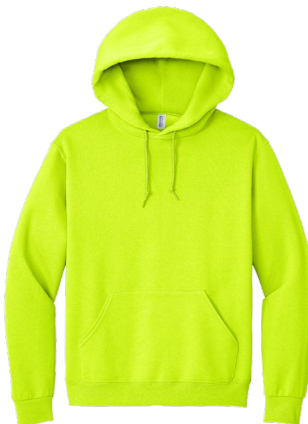
JERZEES® Super Sweats® NuBlend® Pullover Hooded Sweatshirt 4997M | Adult Sizes: S-3XL