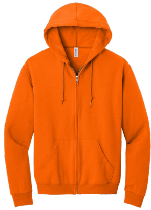
JERZEES® NuBlend® Full-Zip Hooded Sweatshirt 993M | Adult Sizes: S-3XL