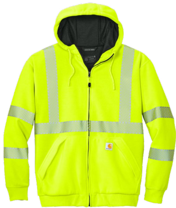
CARHARTT® ANSI 107 Class 3 Lined Full-Zip Sweatshirt CT104988 | Adult Sizes: S-4XL