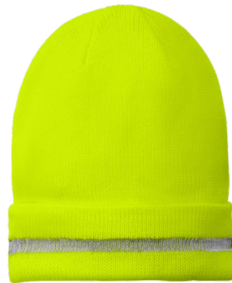
CORNERSTONE® Enhanced Visibility Beanie with Reflective Stripe CS800