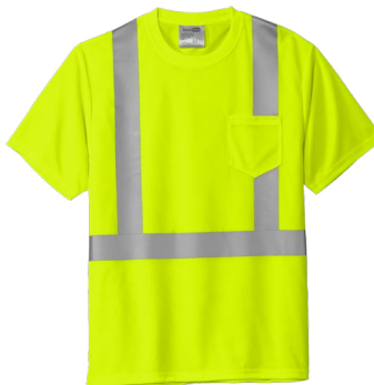
CORNERSTONE® ANSI 107 Class 2 Mesh Tee CS200 | Adult Sizes: S-5XL