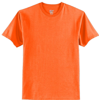
HANES® Authentic 100% Cotton T-Shirt 5250 | Adult Sizes: S-5XL