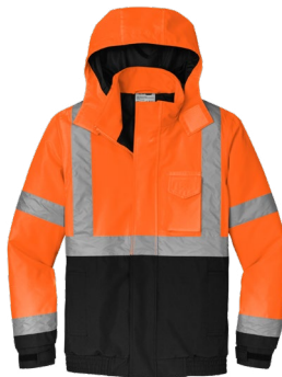
CORNERSTONE® ANSI 107 Class 3 Economy Waterproof Insulated Bomber Jacket CSJ500 | Adult Sizes: S-5XL