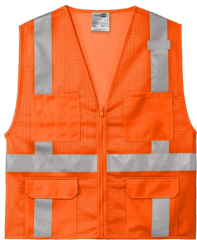
CORNERSTONE® ANSI 107 Class 2 Mesh Six-Pocket Zippered Vest CSV104 | Adult Sizes: S/M, L/XL, 2XL/3XL, 4XL/5XL