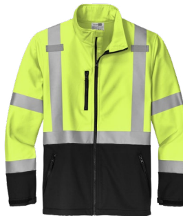
CORNERSTONE® ANSI 107 Class 3 Soft Shell Jacket CSJ503 | Adult Sizes: S-5XL