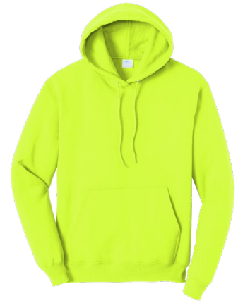
PORT & COMPANY® Core Fleece Pullover Hooded Sweatshirt PC78H | Adult Sizes: S-4XL