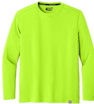
CARHARTT FORCE® Sun Defender™ Long Sleeve T-Shirt CT106972 | Adult Sizes: S-4XL