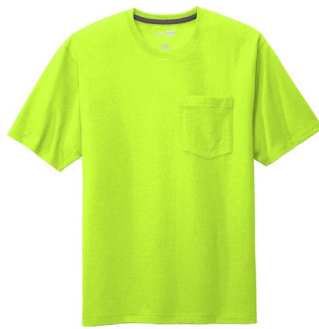
CORNERSTONE® Workwear Pocket Tee CS430 | Adult Sizes: S-4XL