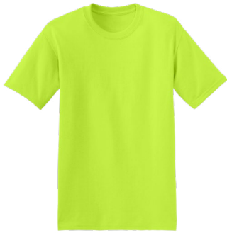
HANES® EcoSmart® 50/50 Cotton/Poly T-Shirt 5170 | Adult Sizes: S-4XL