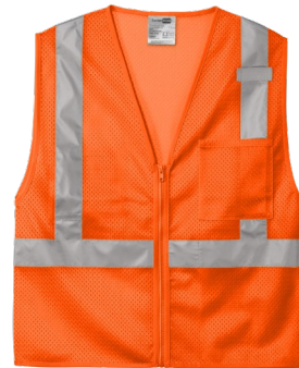
CORNERSTONE® ANSI 107 Class 2 Mesh Zippered Vest CSV102 | Adult Sizes: S/M, L/XL, 2XL/3XL, 4XL/5XL