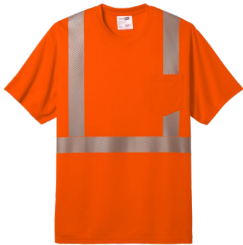
CORNERSTONE® ANSI 107 Class 2 Segmented Tape Tee CS204 | Adult Sizes: S-5XL