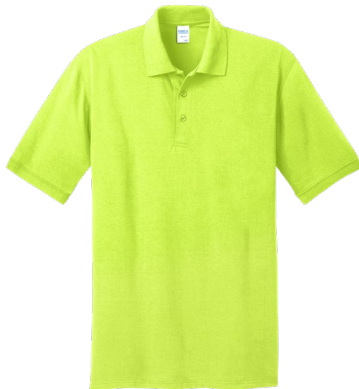
PORT & COMPANY® Core Blend Jersey Knit Polos KP55 | KP55T | Adult Sizes: XS-6XL | Tall Sizes: LT-4XLT