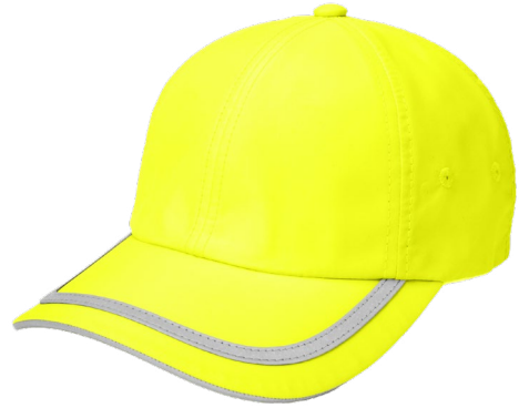
PORT AUTHORITY® Enhanced Visibility Cap C836