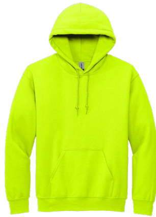
GILDAN® DryBlend® Pullover Hooded Sweatshirt 12500 | Adult Sizes: S-3XL