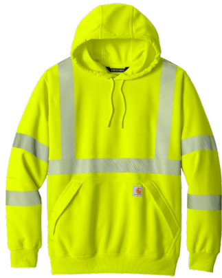
CARHARTT® ANSI 107 Class 3 Hooded Sweatshirt CT104987 | Adult Sizes: S-4XL