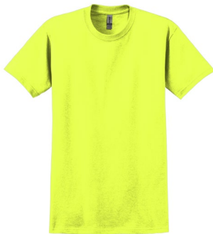
GILDAN® Ultra Cotton® 100% US Cotton T-Shirts 2000 | 2000T | 2000B | Adult Sizes: S-5XL | Tall Sizes: LT-3XLT | Youth Sizes: XS-XL