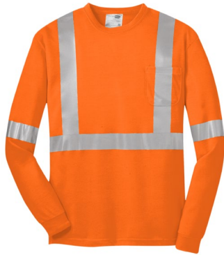
CORNERSTONE® ANSI 107 Class 2 Long Sleeve Safety T-Shirt CS401LS | Adult Sizes: XS-4XL