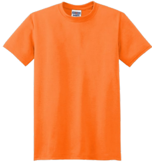
JERZEES® Dri-Power® 100% Polyester T-Shirt 21M | Adult Sizes: S-3XL