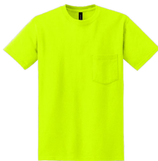
GILDAN® DryBlend® 50 Cotton/50 Poly Pocket T-Shirt 8300 | Adult Sizes: S-3XL