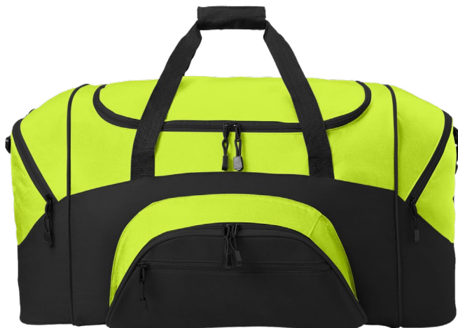
PORT AUTHORITY® Standard Colorblock Sports Duffel BG99