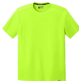
CARHARTT® Short Sleeve T-Shirt CT106020 | Adult Sizes: S-4XL