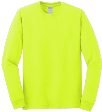
GILDAN® Heavy Cotton™ 100% Cotton Long Sleeve T-Shirt 5400 | Adult Sizes: S-3XL