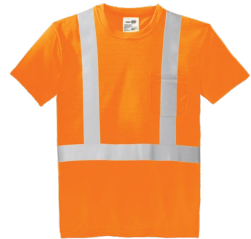
CORNERSTONE® ANSI 107 Class 2 Safety T-Shirt CS401 | Adult Sizes: XS-4XL