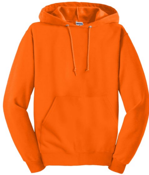
JERZEES® NuBlend® Pullover Hooded Sweatshirt 996M | Adult Sizes: S-4XL