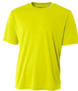
A4 Sprint Performance Tee A4N3402 | Adult Sizes: XS-4XL