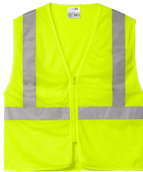
CORNERSTONE® ANSI 107 Class 2 Economy Mesh Zippered Vest CSV101 | Adult Sizes: S/M, L/XL, 2XL/3XL, 4XL/5XL