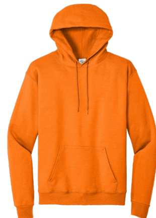
HANES® EcoSmart® Pullover Hooded Sweatshirt P170 | Adult Sizes: S-5XL