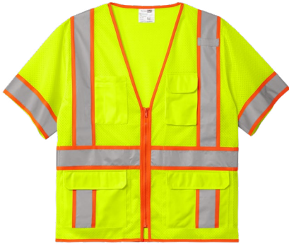
CORNERSTONE® ANSI 107 Class 3 Surveyor Mesh Zippered Two-Tone Short Sleeve Vest CSV106 | Adult Sizes: M-5XL