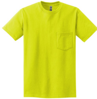
GILDAN® Ultra Cotton® 100% US Cotton T-Shirt with Pocket 2300 | Adult Sizes: S-5XL