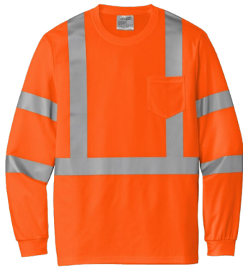
CORNERSTONE® ANSI 107 Class 3 Mesh Long Sleeve Tee CS203 | Adult Sizes: S-5XL