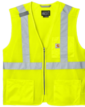
CARHARTT® ANSI Class 2 Mesh Zip-Front Vest CT106171 | Adult Sizes: XS/S, M/L, XL/2XL, 3XL/4XL