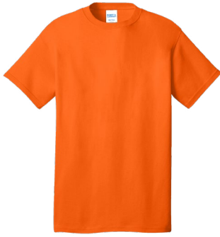
PORT & COMPANY® Core Cotton Tee PC54 | Adult Sizes: S-6XL