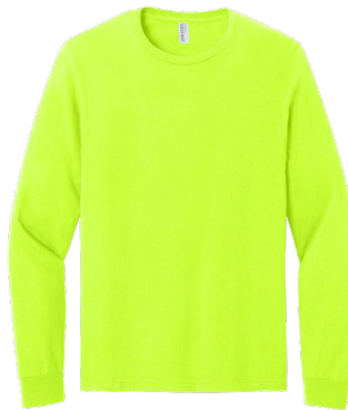
JERZEES CLASSICS™ Unisex Cotton Long Sleeve T-Shirt 363L | Adult Sizes: S-3XL