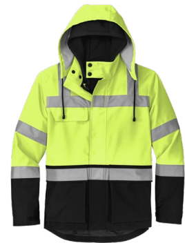
CORNERSTONE® ANSI 107 Class 3 Waterproof Ripstop 3-in-1 Parka CSJ502 | Adult Sizes: S-5XL