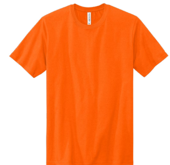
VOLUNTEER KNITWEAR™ All-American Tee VL100 | Adult Sizes: S-4XL