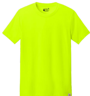
CARHARTT FORCE® Sun Defender™ Short Sleeve T-Shirt CT106868 | Adult Sizes: S-4XL