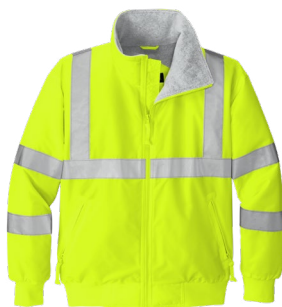
PORT AUTHORITY® Enhanced Visibility Challenger™ Jacket with Reflective Taping SRJ754 | Adult Sizes: XS-6XL