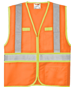
CORNERSTONE® ANSI 107 Class 2 Dual-Color Safety Vest CSV407 | Adult Sizes: S-4XL