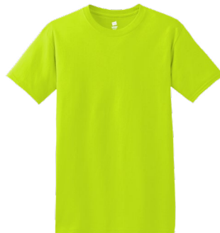
HANES® Essential-T 100% Cotton T-Shirt 5280 | Adult Sizes: S-3XL