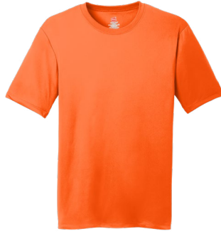
HANES® Cool Dri® Performance T-Shirt 4820 | Adult Sizes: XS-3XL